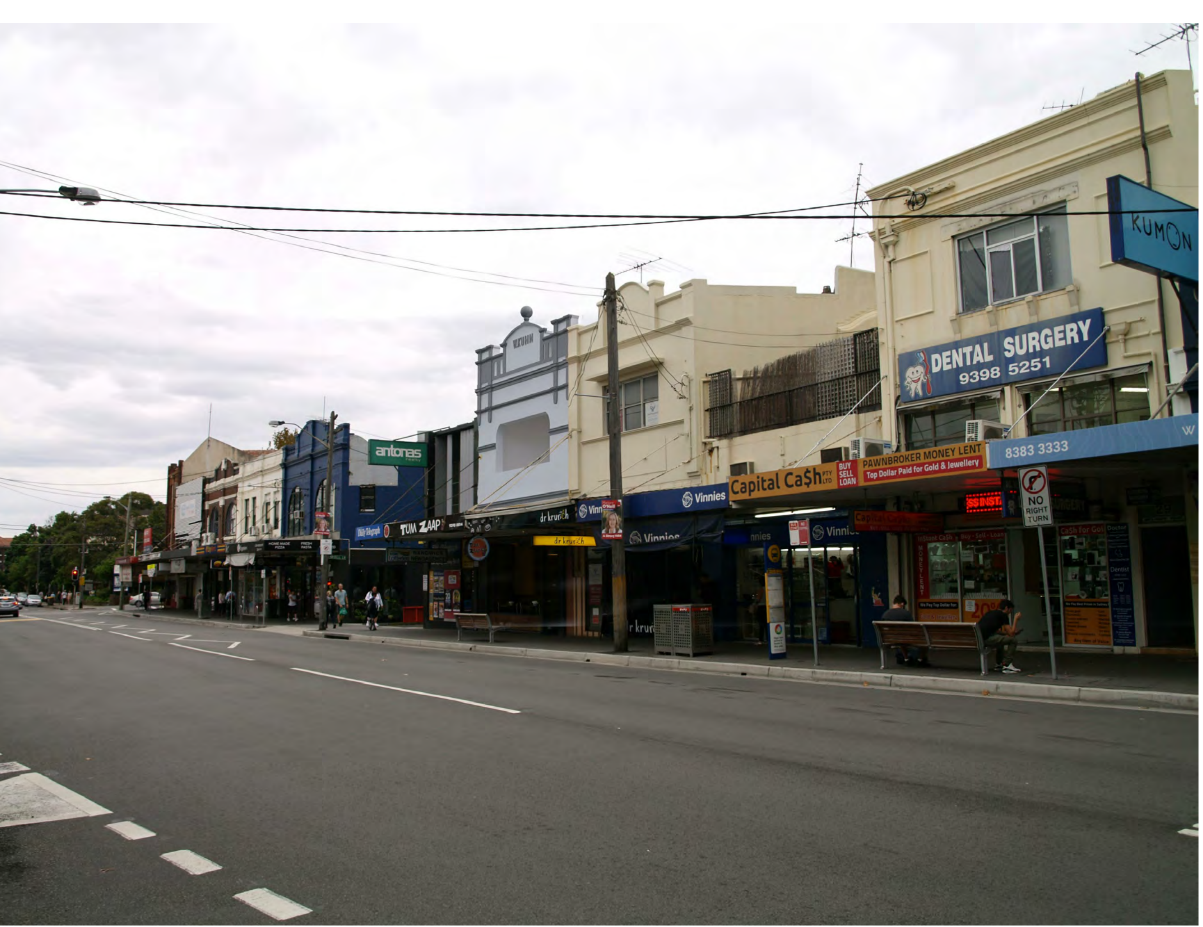
VIEW OF 23 BELMORE ROAD FROM SOUTH - PROPOSED