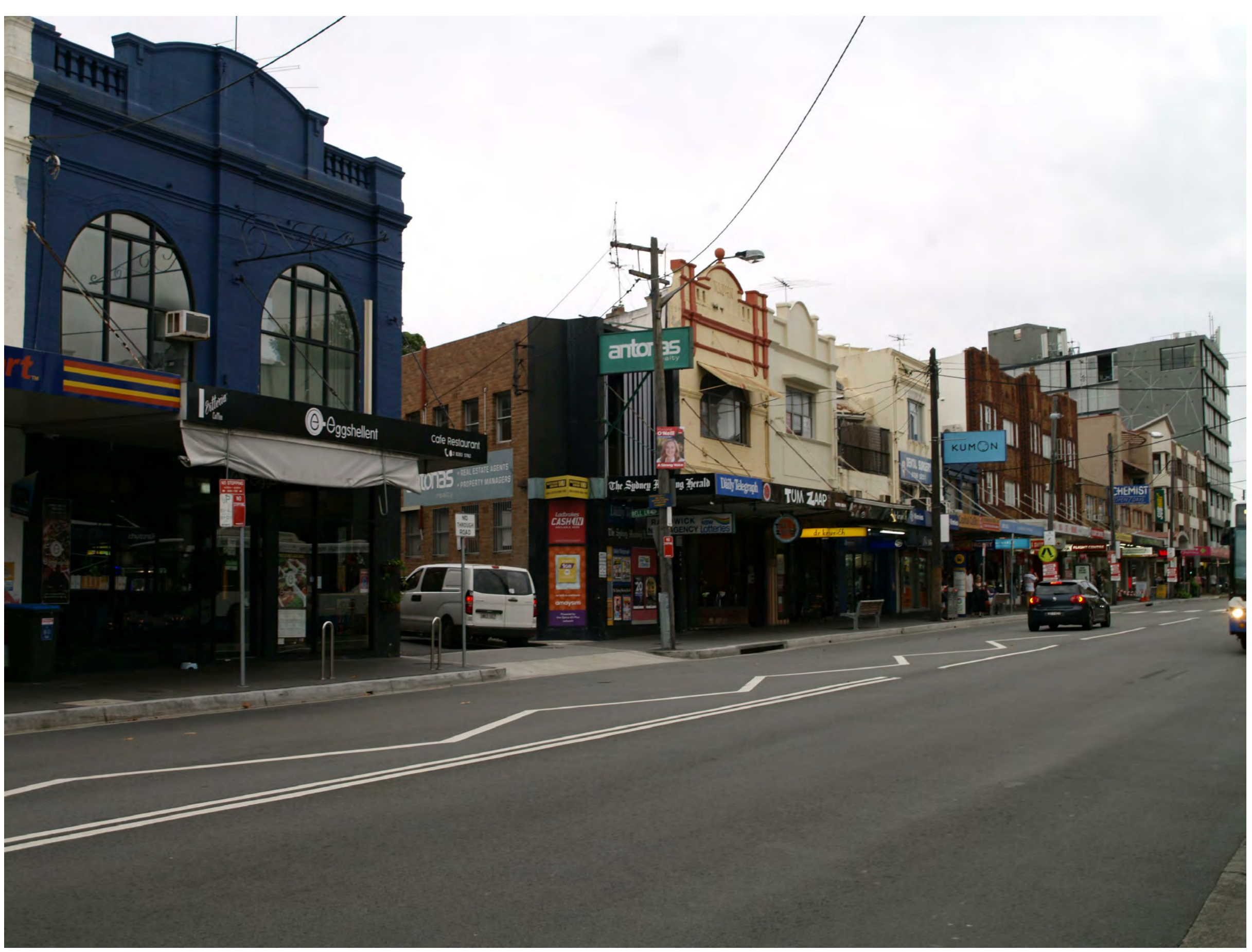
VIEW OF 23 BELMORE ROAD FROM NORTH - EXISTING