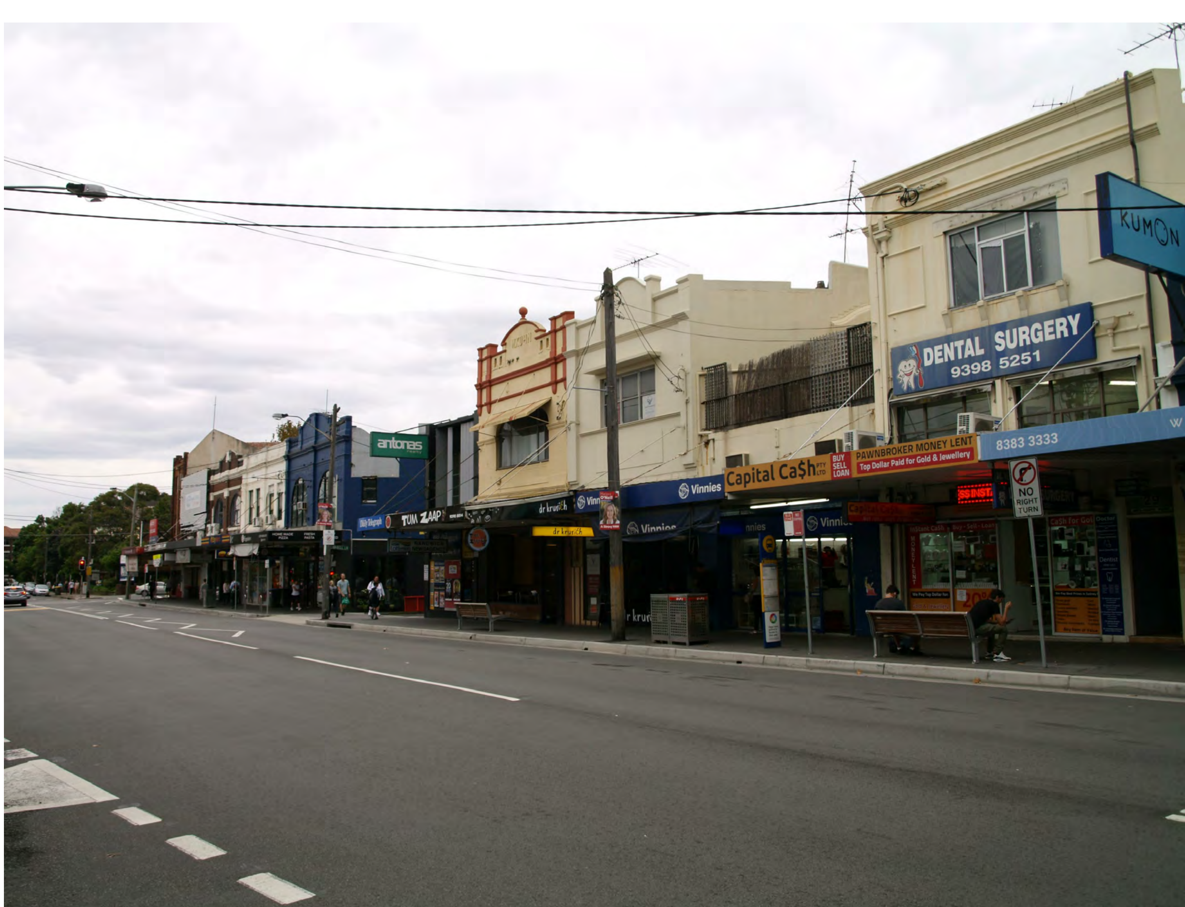
VIEW OF 23 BELMORE ROAD FROM SOUTH - EXISTING